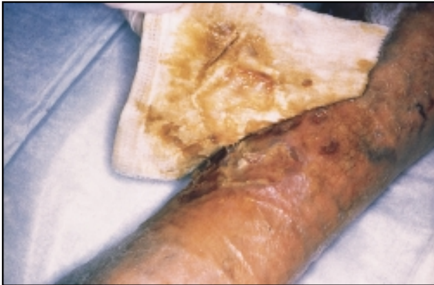
Fig. 1. The debriding action of honey detaches slough so that it lifts off with the dressing.

supply of glucose which is essential for the 'respiratory burst' of phagocytes.