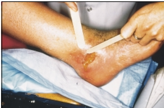
Fig. 2. Honey applied directly to surface wounds tends to run off.

gen peroxide has been found to stimulate the proliferation of fibroblasts. [64] It has been proposed that hydrogen peroxide could be used to promote the wound healing process if the concentration could be carefully controlled: [64] controlled sustained release of hydrogen peroxide is achieved with honey. It has also been proposed that honey be used in place of recombinant growth factors to stimulate the healing of burns. [65]