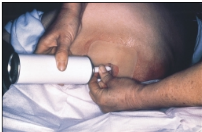
Fig. 4. A pressurized system being used to fill a sinus with sterilized honey.